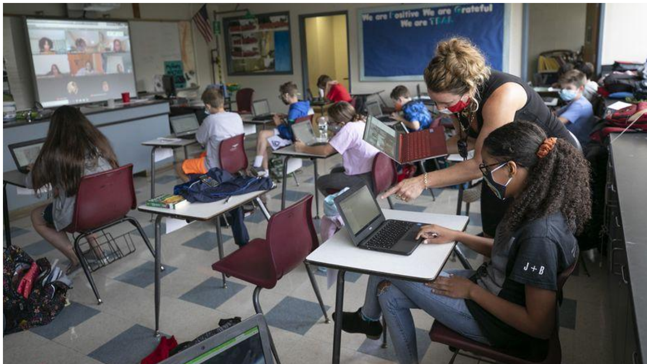
Connecticut towns and cities will be receiving $443 million in federal pandemic assistance under the CARES Act approved by Congress and signed into law by former President Donald Trump last year.