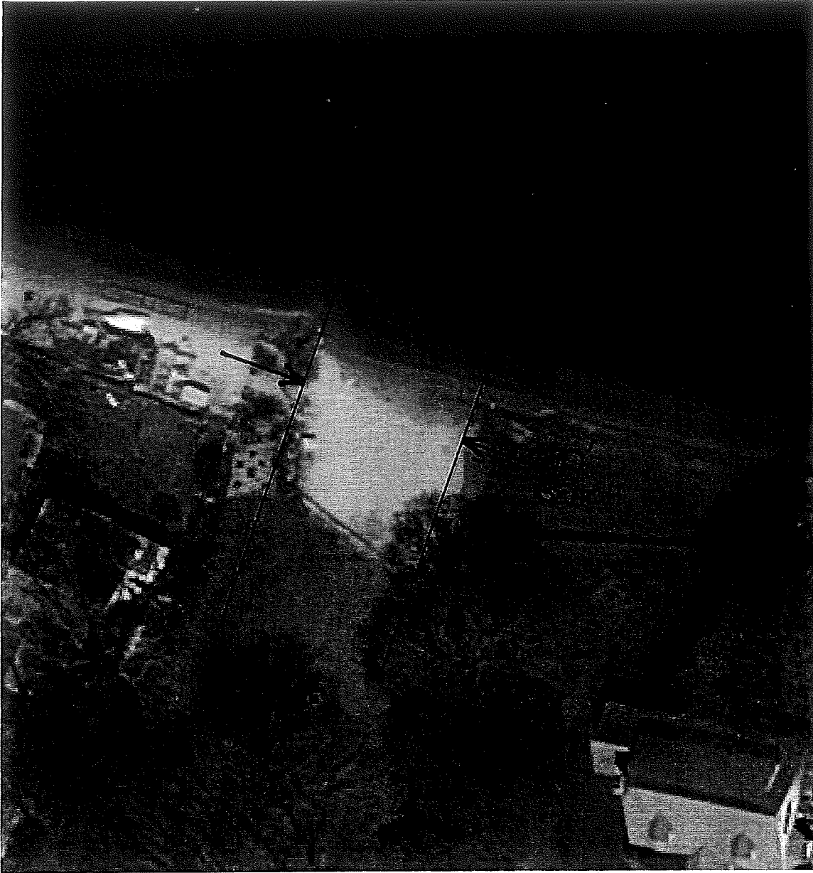
Gerald Park Association Beach